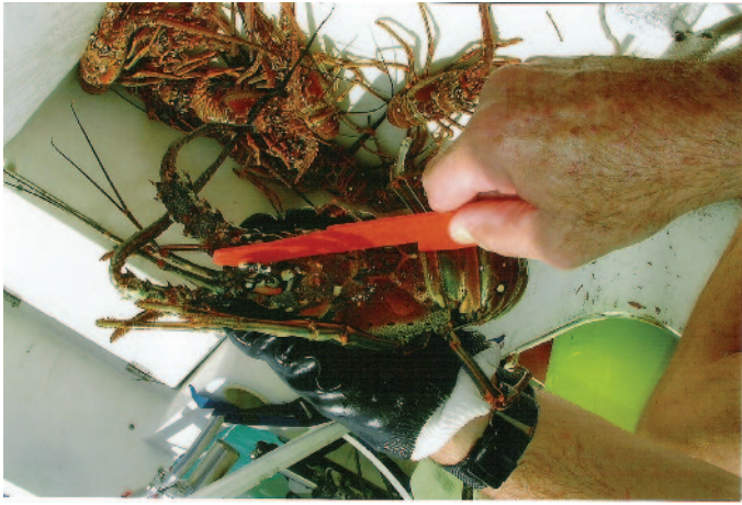
Fig. 4. Lobsters are measured by hooking one end of the gauge over the notch between the horns and stretching it over the carapace.