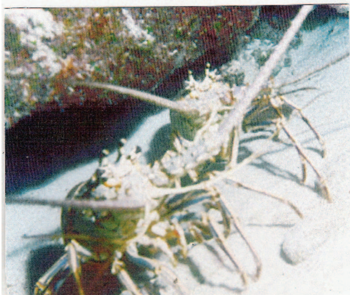
Fig. 1. Spots that are loaded with keeper-sized lobsters can be found by the determined diver.

them because they know that a good spot can remain productive for a long time if it's not over fished. They'll even use devious means to misdirect other divers, a tactic that I fell for quite a few times myself. And I must admit, I too am very reluctant to reveal my best spots.