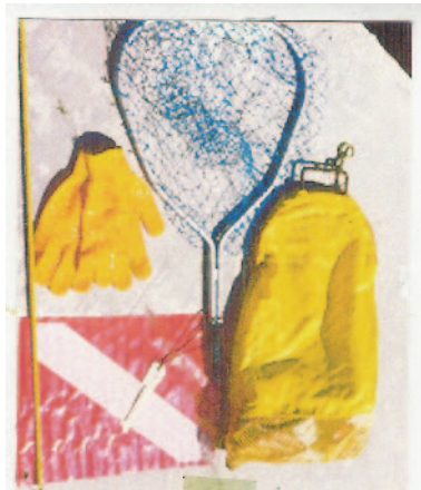
Fig. 2. The equipment necessary for catching lobsters includes a diver down flag, measuring gauge, hand net, tickle stick, pair of gloves, and bug bag.

The equipment you'll need is fairly simple, inexpensive, and easy to find. Many divers simply buy a "Lobster Assassination Kit" (doesn't sound very sporting, does it?). These are available in most South Florida dive shops and usually include the essential pair of gloves, a tickle stick, a hand net, the mandatory lobster gauge, and a bug bag. You can buy the kit or you can put one together yourself.