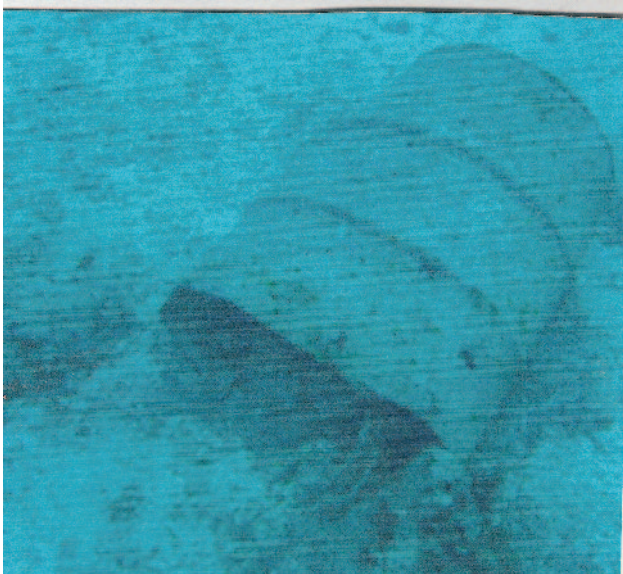
Fig 3. For decades the locals have been dropping stuff like this flattened oil drum on the reef tract to attract spiny lobsters.

For decades, the locals have been dropping materials intended to attract crawfish. They're usually unmarked and used to be fair game for whoever found them. However, the latest regulations forbid taking lobsters from any artificial habitat. Ice molds, flattened oil drums, old toilets and drain pipe were traditional favorites.