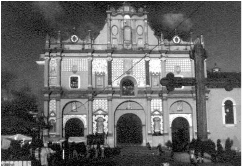
San Cristobal cathedral

The census of 1990 came up with a strikingly different finding. Out of the Chiapas population (over the age of five years), it showed 67.63 percent Catholic, 18.20 percent non-Catholic, 12.73 of no religion and 4.45 percent unspecified. Considering the proliferation of evangelical churches throughout Chiapas, the census results were obviously in error. And what does the 12.73 of no religion mean? Even pagans have a religion. As Rosalva Aida Hernandez Castillo commented: "The Gimenez book and articles by [Rudolfo] Casillas show [that] the government statistics have little credibility."